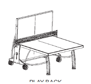
Norme EN 14468-1 (classe C)